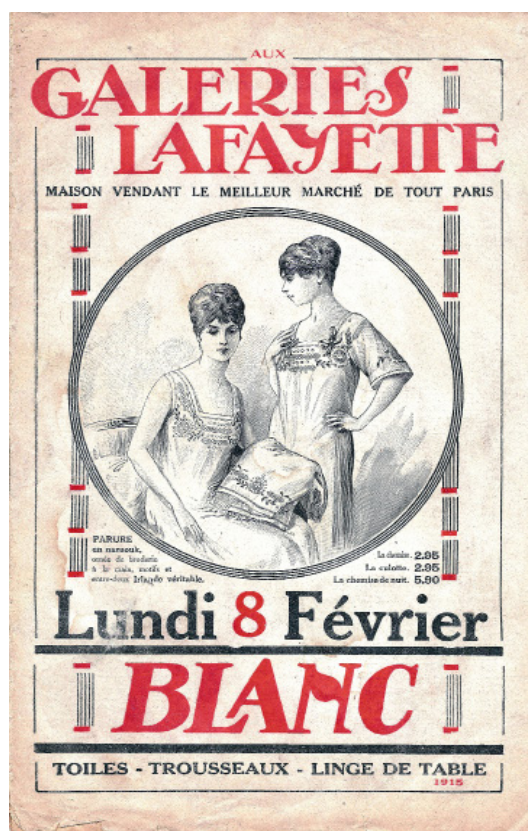
Catalogue «Blanc», Aux Galeries Lafayette, 1915